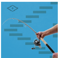
Fishing Equipment & Marine Sports