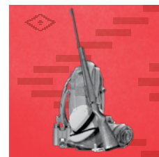
Hunting & Shooting Sports Guns & Equipment