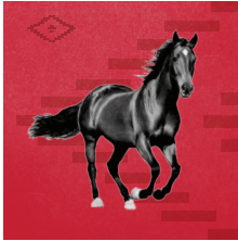
Hunting & Shooting Sports Guns & Equipment