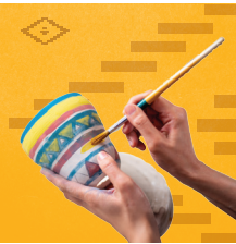
Arts & Crafts