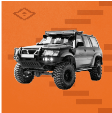
Outdoor Leisure Vehicle & Equipment