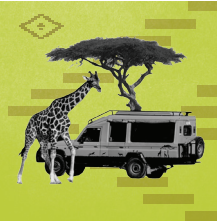
Hunting Tourism & Safari