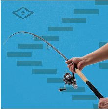
RVs & Motorhomes